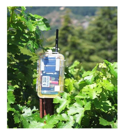
Figure 1: DOT - Wireless Sensor Network Device Deliberate to be the Estimated Size of Area

anomalies for several years on a single set o batteries. In addition to reducing the installation costs, wireless sensor networks have the ability to dynamically adapt to changing environments. Adaptation mechanisms can respond to changes in network topologies or can cause the network to shift between different modes of operation. Example, the same embedded network performing leak monitoring in a chemical factory might be reconfigured into a network designed to localize the source of a leak and track the diffusion of poisonous gases.